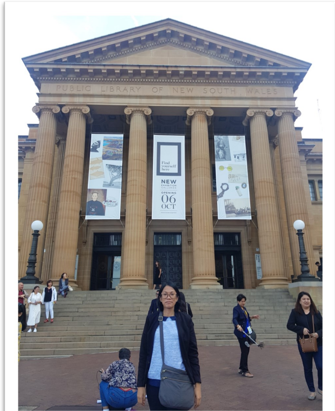
Me posing at the façade of the State Library of New South Wales