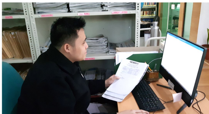
Making overtime duty at the Periodicals Section tallying QCPL personnel's total rendered extended hours on a night duty.