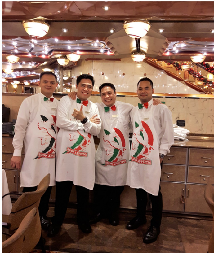
Inside the cruise ship Costa Favolosa with my waiters inside Ristorante Duca Borgogna in an Italian Night