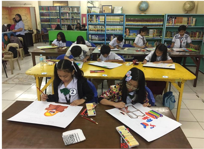
Participants during the on-the-spot poster and slogan making contest

It was a successful major activity that happened, where creativity and colorful imagination drew in the minds of the students.