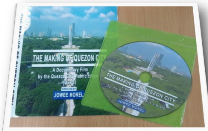
The documentary film entitled “The Making of Quezon City” in CD