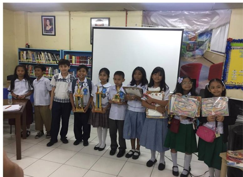
The winners of the “On-the-Spot Poster and Slogan Making Contest”