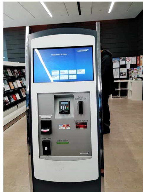
Kiosk for scanning borrower's card in Surry Hill Library and Community Center.