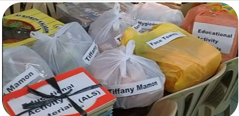
Hygiene kits and snacks distributed to Molave Youth Home residents