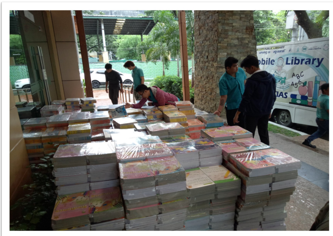
Ten thousand (10,000) volumes of book at the façade of Quezon City Public Library QCPL donated by Rex Book Store.

Two trucks containing ten thousand (10,000) books arrived at the QCPL main library early morning of October 30, 2018. The books were generous donation of one of the largest educational book publisher and bookstore chain in the Philippines, Rex Book Store, Inc. The donation was composed of assorted titles of textbooks in different subject areas for elementary and secondary education.