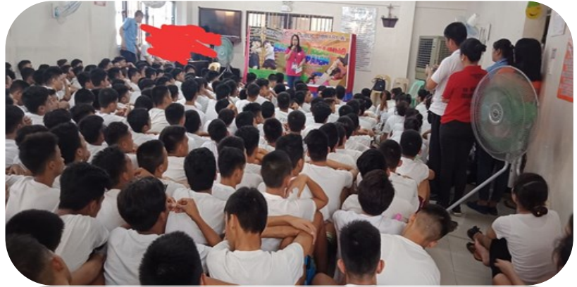
Residents of Molave Youth Home on white t-shirts enjoying watching puppet show prepared by QCPL puppeteers